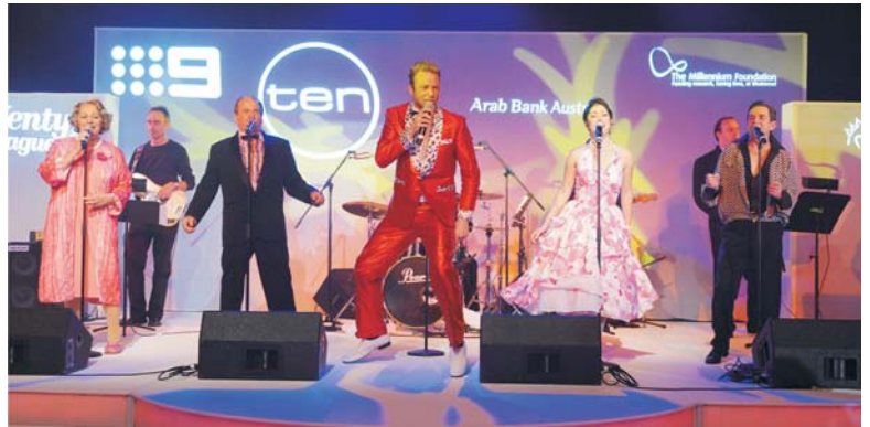
The Cast of Shout